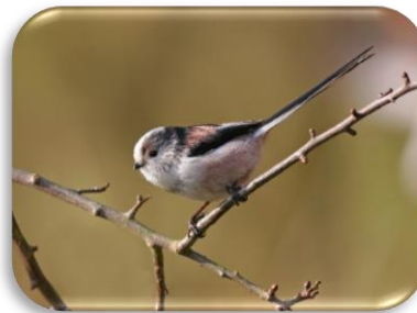
Long Tailed Tit