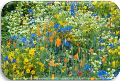
Wildflowers for each colour of the rainbow

Scavenger Hunt! How many of these can you spot as you make your way around this route?