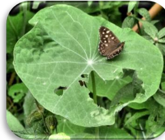
A nibbled leaf