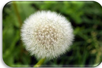
A fluffy dandelion