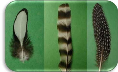
Feathers with interesting patterns