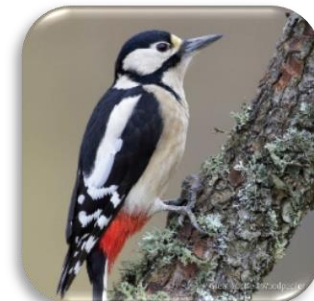
Greater Spotted Woodpecker