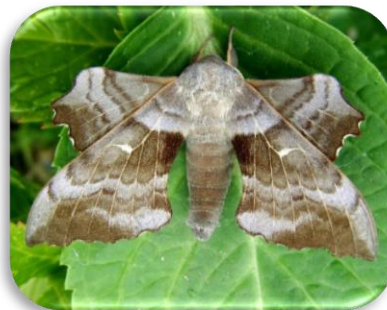
Poplar Hawk Moth