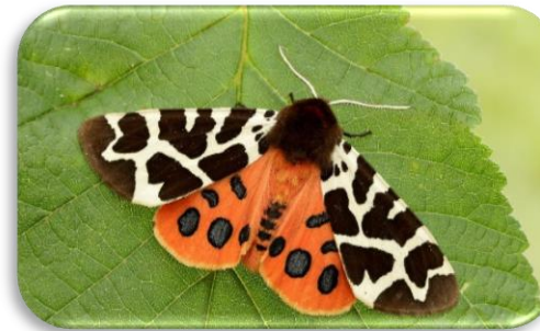
Garden Tiger Moth