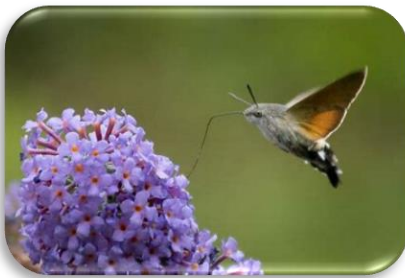
Hummingbird Hawk Moth

Moth Treasure Hunt: How many of these did you find walking around the route today?