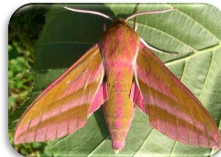
Elephant Hawk Moth