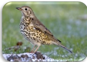
Mistle thrush (larger)