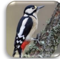
Greater Spotted Woodpecker