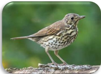
Song Thrush (small)